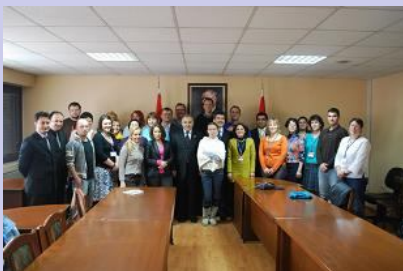
Meeting Director of Education, Izmir