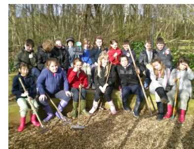
Gardening Club Year 5 Pupils

Pupils will plan out the school plot, plant seeds and seedlings, care for the plants, chart their growth and harvest the fruits of their labour.