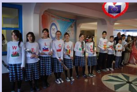
Yamanlar students welcome us!