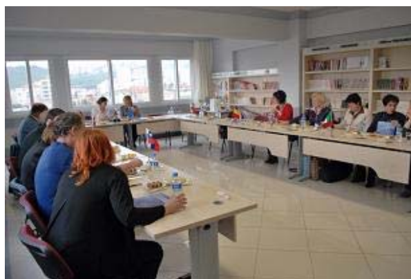
Top left: Yamanlar students welcome Comenius visitors.