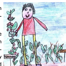
An Italian student’s picture of their school garden.

Our menu will include the following dishes: a Spanish garden salad, a Spanish potato omelet accompanied by fried green peppers, fried eggplants in sugar-cane honey and Spanish gazpacho to drink. ¡Que aproveche!