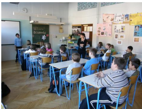
Our meeting with the cute children and lovely staff at Osnovna Šola Fram. Slovenia

Our staying in Slovenia was a very generous opportunity to meet Slovenian pupils and teachers and had long talks with them, eat traditional food and taste their wine that they are very proud of. We even picked up grapes in a vineyard and helped making wine. We had various creative workshops in handicrafts.